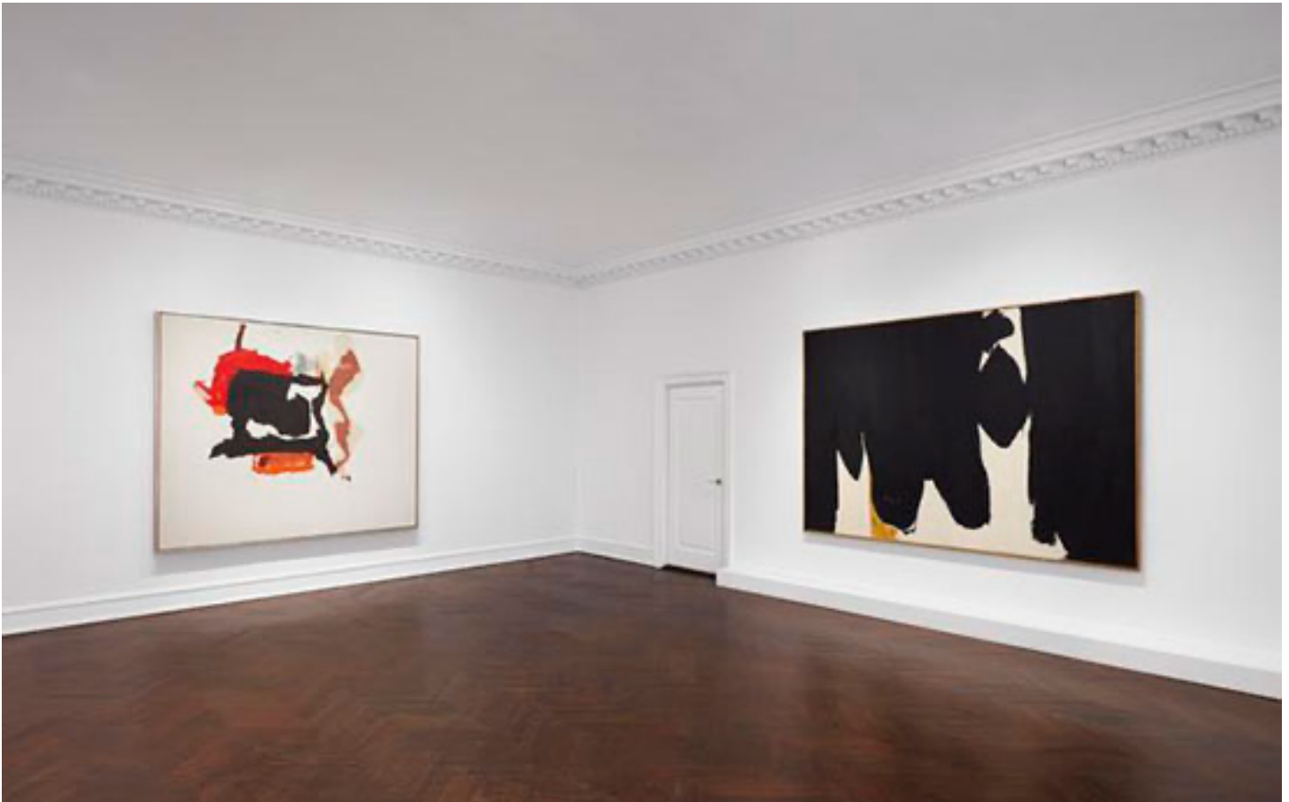
Installation shot of the exhibition under review showing Helen Frankenthaler, Black with Shadows, 1961 [left] and Robert Motherwell, Diary of a Painter, 1958.

The Art of Marriage: Helen Frankenthaler, Robert Motherwell at Mnuchin Gallery