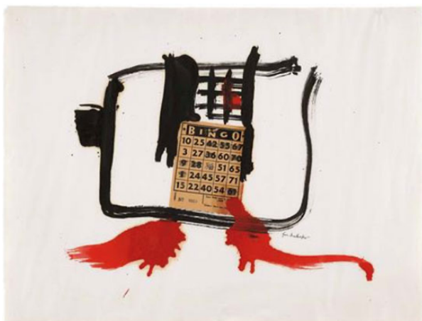
Helen Frankenthaler, Bingo, 1962. Oil and collage on paper, 18-1/2 x 24-3/4 inches

She describes with particular acuity the common drive towards “simpler, more economical imagery” in their distinct paths through the later 1960s (and years of their formal union) with Frankenthaler’s “large expanses of relatively few colors, strategically placed, with the edges of shapes carrying the burden of drawing” and Motherwell’s “even more (apparently) restrained Open series based on the infinite possibilities of drawn or painted interior rectangles played against the rectangle” of the support.