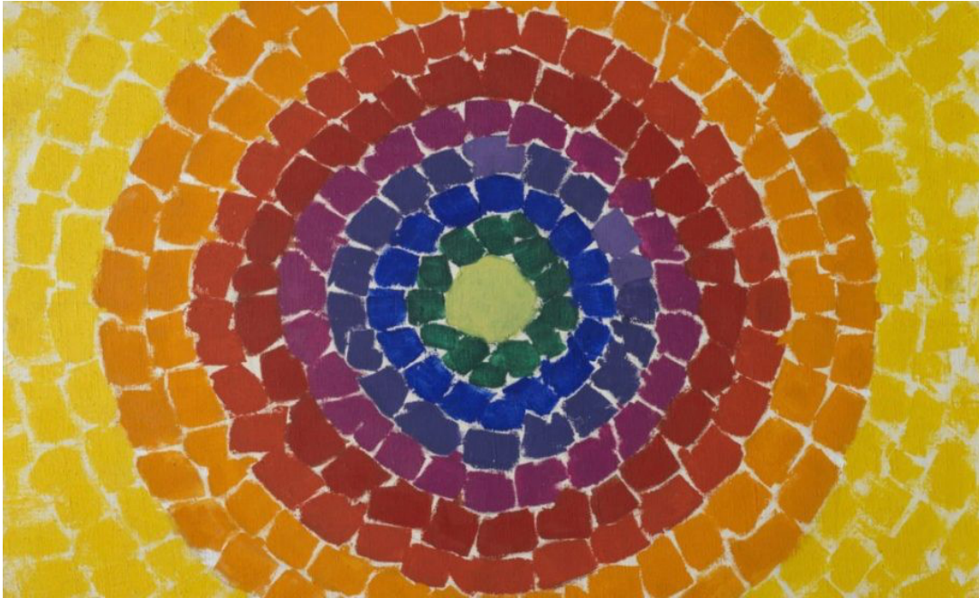
Alma Thomas, 'Resurrection', 1966 acquired by the White House in 2015.