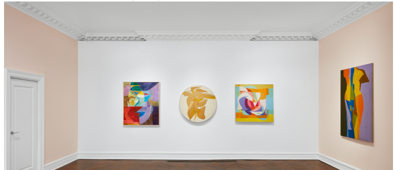
Installation view of "Betty Blayton: In Search of Grace," Mnuchin Gallery, New York, N.Y. (Sept. 8 – Oct. 16, 2021).