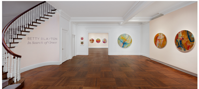
Installation view of "Betty Blayton: In Search of Grace"

The exhibition is accompanied by a fully illustrated catalog authored by art historian Lowery Stokes Sims, a close friend of Blayton.